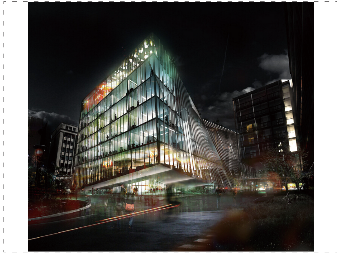
Project 1> Name / Location: Paris PARC / Paris, France The building site is wedged into a dense context between the emblematic architectures of the Albert Grid the Cassan building and the Institute Monde Arabe. The site connects the IMA square to the park, and fills the space of the originally planned green axis of the Jussieu Campus.