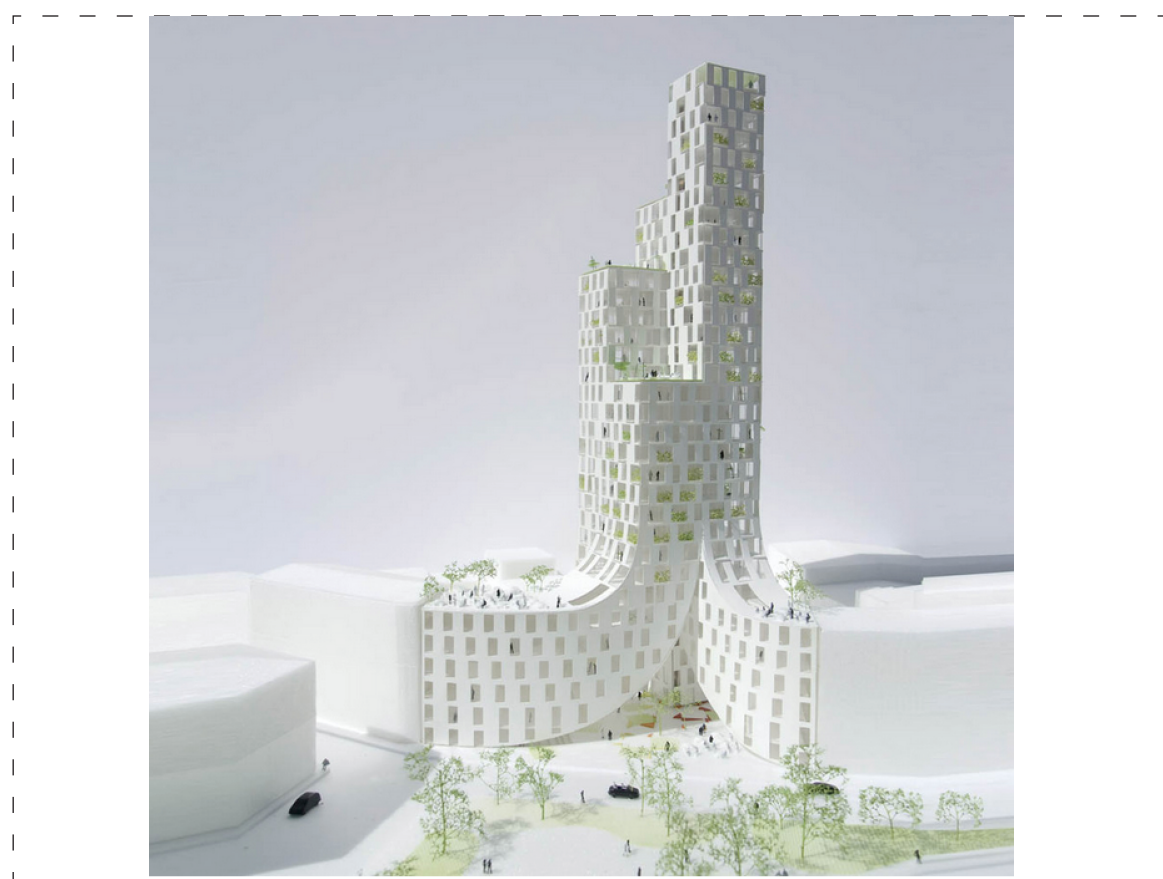
Project 3> Name / Location: Boscolo Hotel / Nice, France The three adjacent buildings and new fourth one are extend to merge in a single structure, creating a series of gates for the public park to pass beneath them. Like a contemporary interpretation of the archway or passage, the hotel forms a generous cover for the public life beneath.