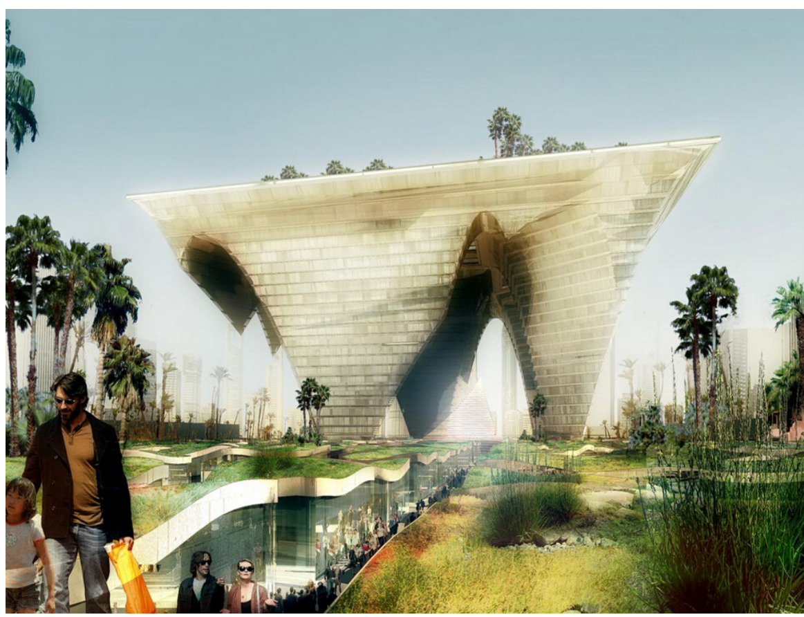
Project 2> Name / Location: The 5 pillars of Bawadi / Bawadi, Dubai The traditional hotel diagram - fat at the bottom, thin at the top. However the value diagram is inversely proportioned as an inverted pyramid with maximum program on the top, and a reduced footprint. The generic layout of an American hotel and retail complex is a public podium with private towers. Following the logic of the inverted pyramid of value and sustainability the architects propose to turn the American city upside down. A public canopy resting on a forest of private columns. The canopy can contain all the public functions supporting the hotels - lobby, restaurants, gardens, conferences, auditoria, banquets spaces and retail. An urban canopy of program supported by five pillars of accommodation. As an architectural embodiment of an Islamic society itself, it is an elevated community in the sky founded on 5 pillars.